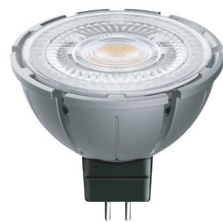
GMR16 7.5W DIM