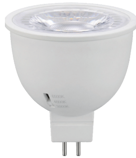
GMR16 6W TC