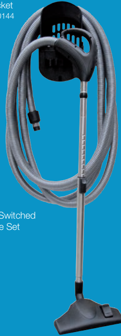
9m Switched Variable Speed Hose Set