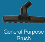
General Purpose Brush