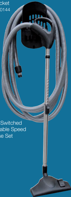
9m Switched Variable Speed Hose Set